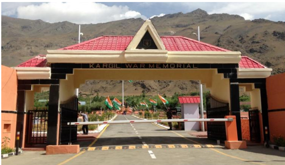
Kargil War Memorial