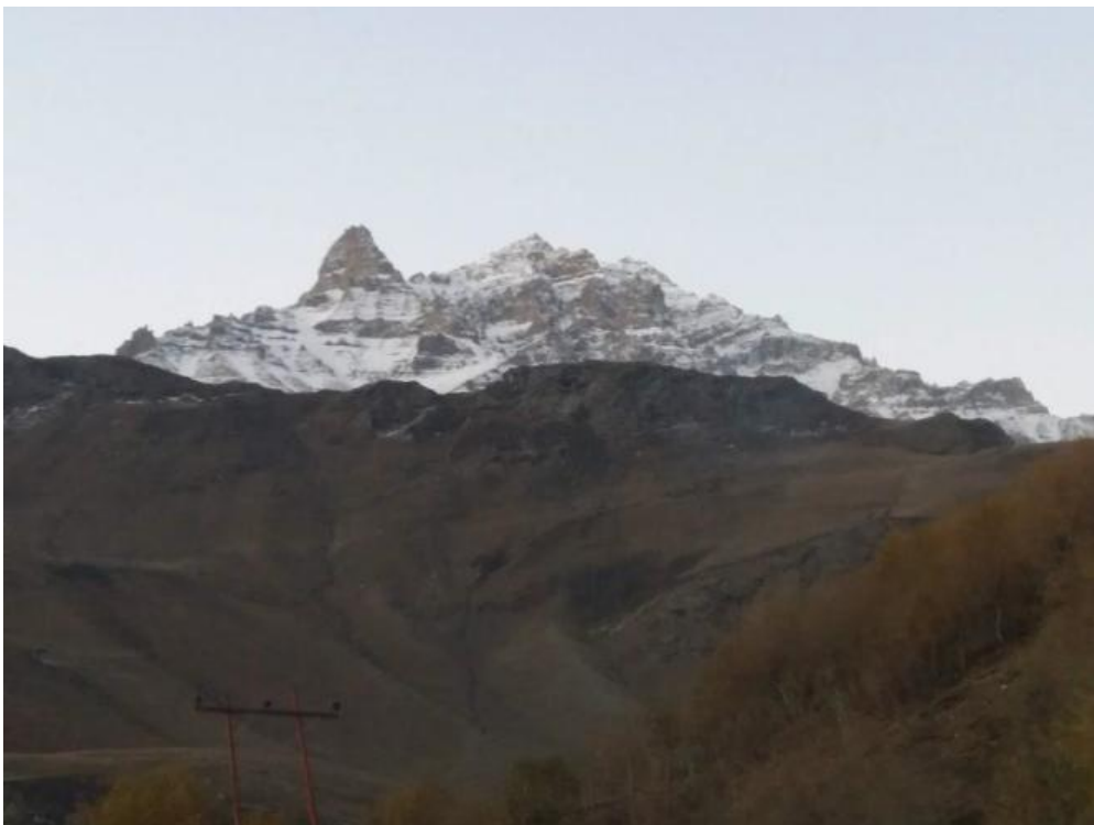
Scenic view on the way to the distribution camp