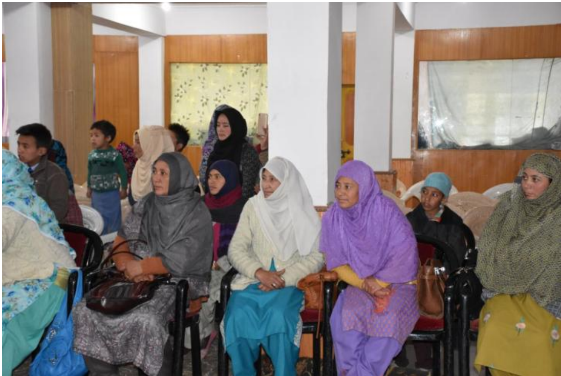
Patients seated at the distribution camp