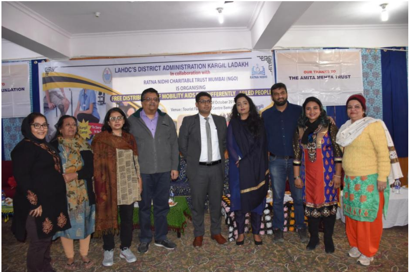
The Ratna Nidhi team with guests at the camp